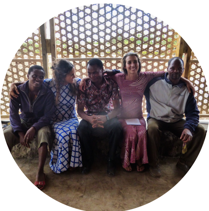
Social Practice Architecture (SoPA)

SoPA is a young architecture studio, who understand architecture as a tool to improve life and society. Their work seeks to reinterpret the techniques and old skills, inspired by vernacular heritage, and fused with contemporary design practices to create unique work that engages the specificity of the site. Their international experience has allowed them to specialize in different building techniques and materials such as earth construction.